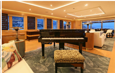
Main saloon - Piano