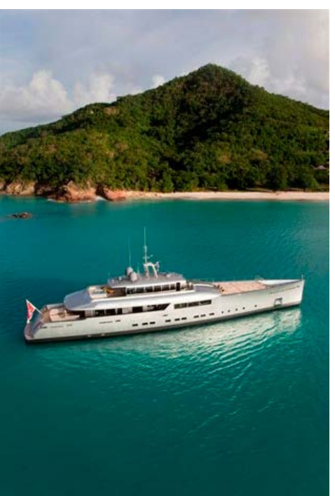
Bow view Aerial view