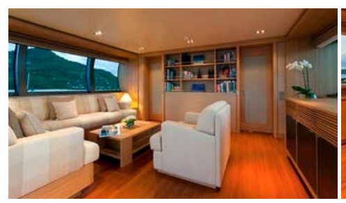
Upper deck lounge from aft