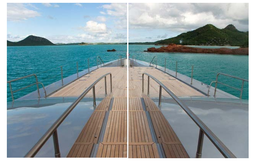
Bow #1 Bow #2