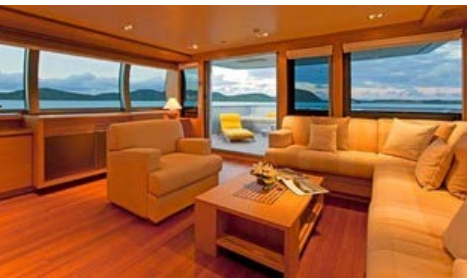
Upper deck lounge