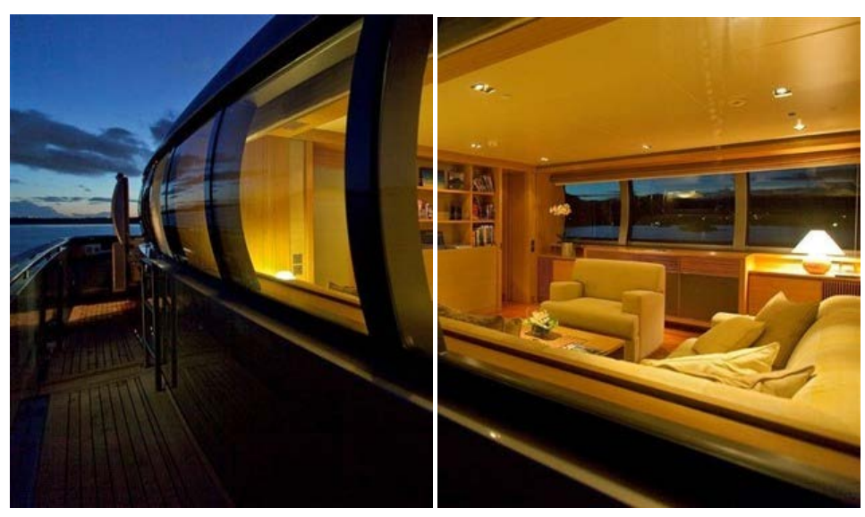
In & Out upper deck lounge #1