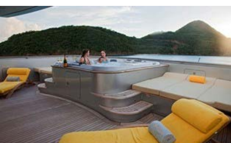
Upper aft deck jacuzzy