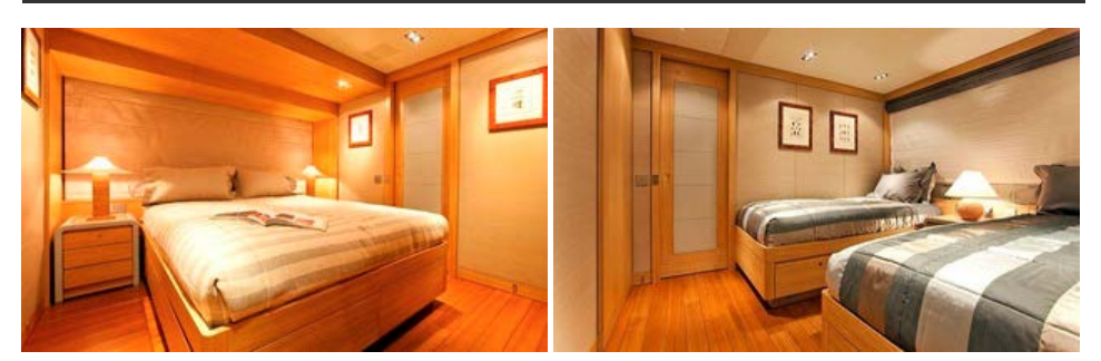
Guest queen cabin