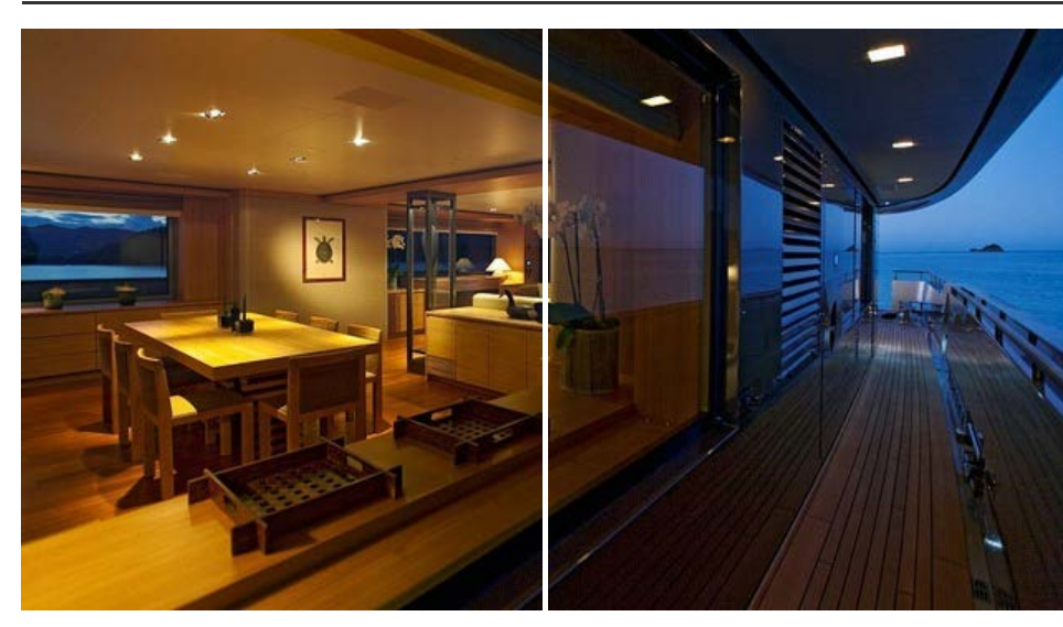
Dining room In & Out #1