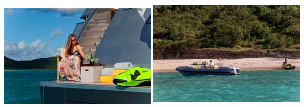
Swimming platform Tender & toys