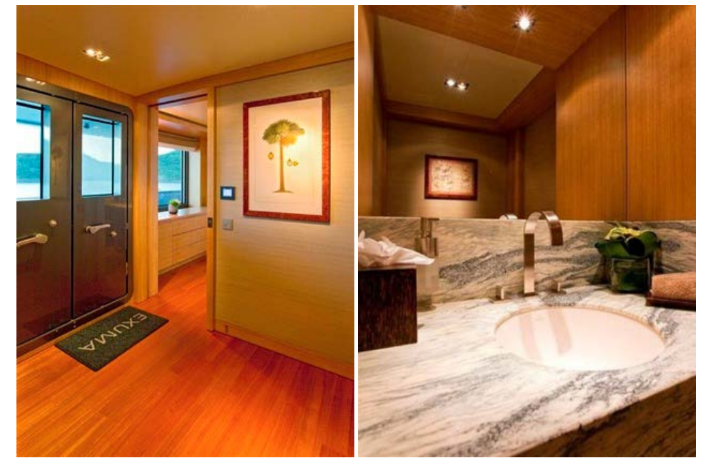
Main foyer Day Head