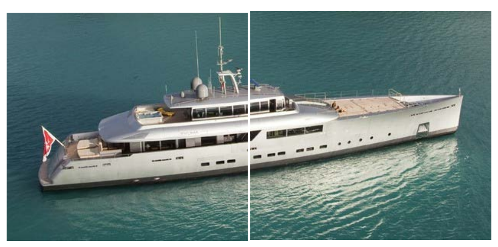
Profile #1 Profile #2

With her shallow draft and incredible water toys, EXUMA is perfect for exploration and adventure!